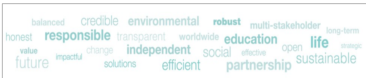
[Fig.1: A graphic on the ASC website that is also used in their press releases]